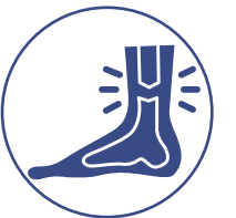
Sprains and minor injuries