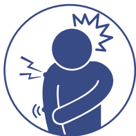
Bites and stings

You can use the virtual Emergency Department if you are having an urgent medical issue that is not life-threatening.