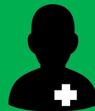
Runner (No PPE)