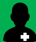
RN— Charting (In PPE)