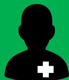
Safety Lead (No PPE)